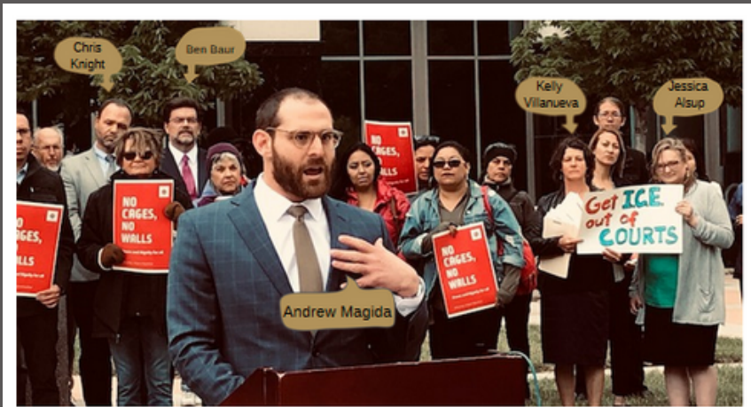
The event and pic were featured in LOPD's very first newsletter.

Days later, LOPD joined this press conference calling for some solution in New Mexico.